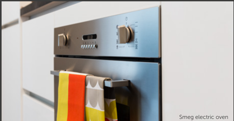
Smeg electric oven