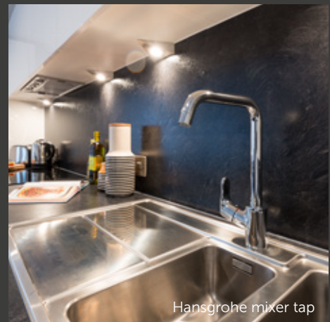
Hansgrohe mixer tap