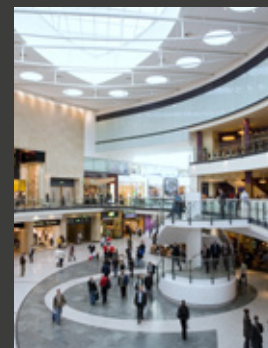
Location Images, clockwise: Printworks, Spinningfields, Home Sweet Home, The Foundation, Teacup Kitchen, Arndale Centre, Exchange Square, ODD Bar, Northern Quarter.