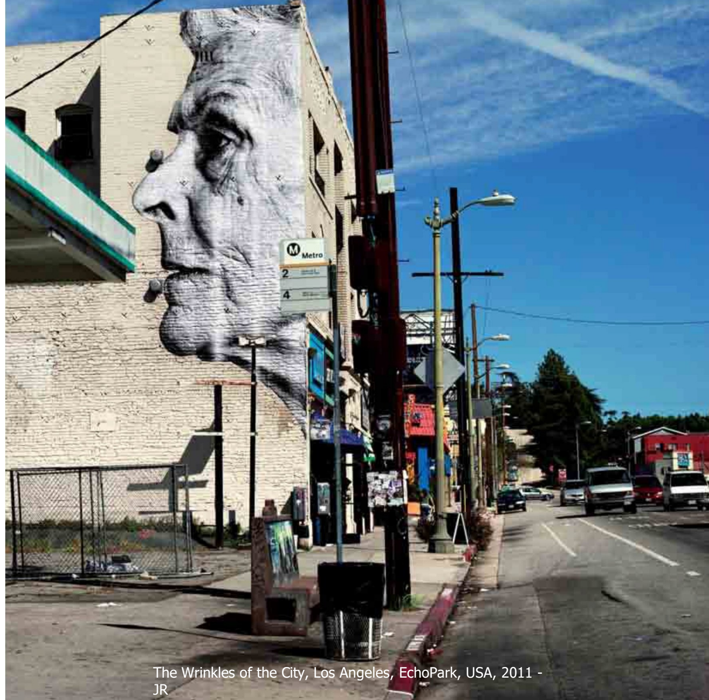
The Wrinkles of the City, Los Angeles, EchoPark, USA, 2011 - JR