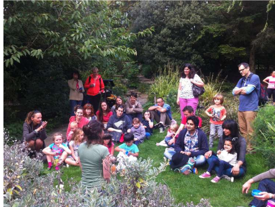
Health & wellbeing