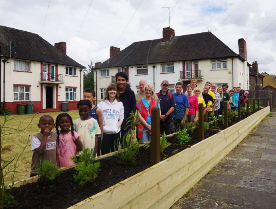
Places for community