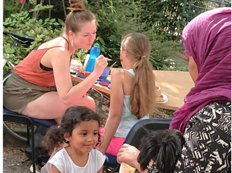
Social cohesion & safety