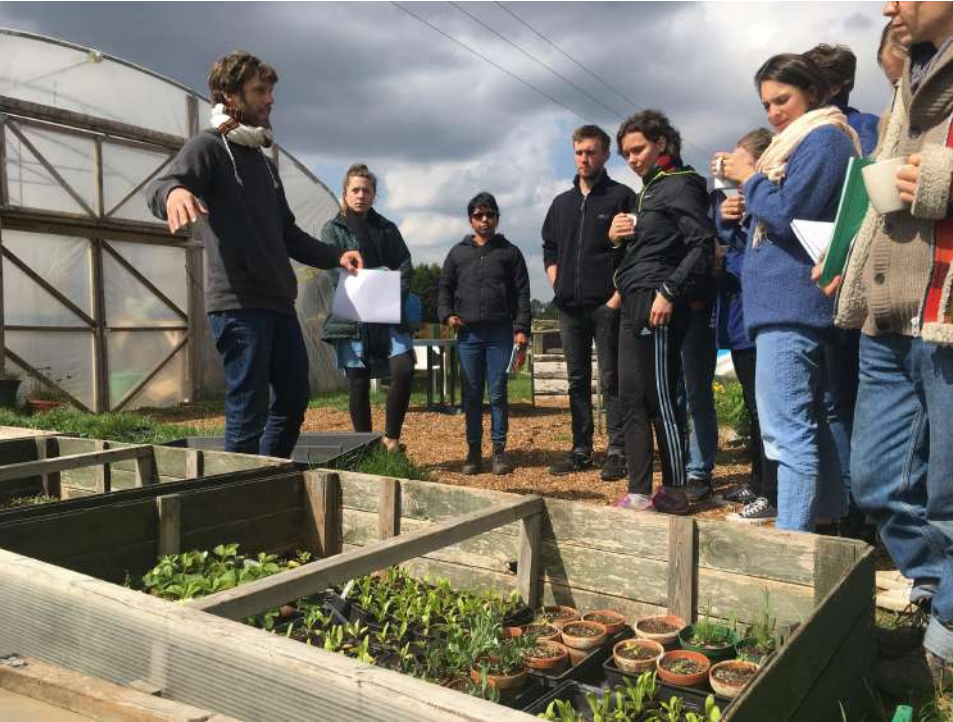
Permaculture & horticulture