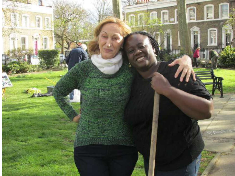
Quality of life