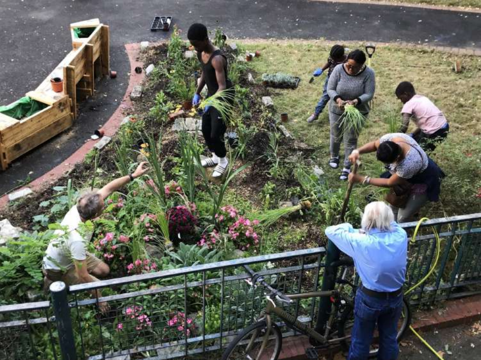
Ownership & belonging