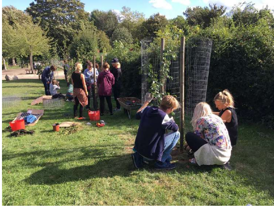
Food growing gardens & orchards