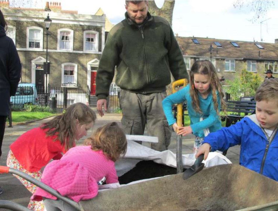
Spaces accessible to all