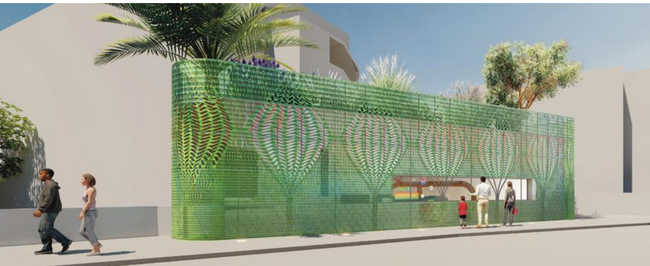
Renewable Boiler Room