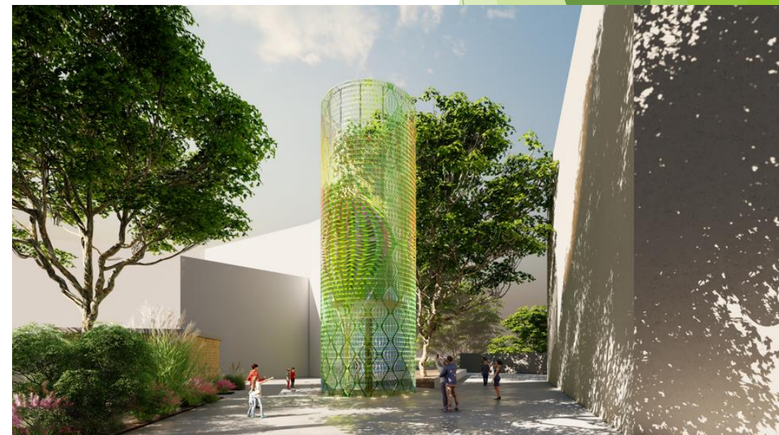
Renewable Heat Store