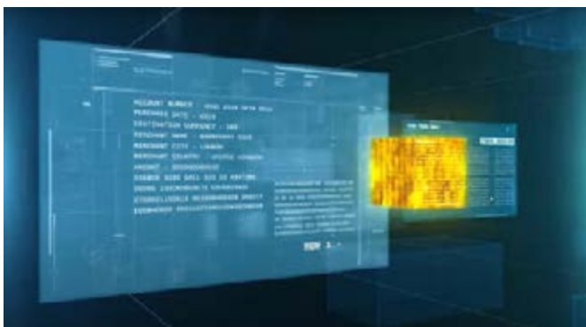
Just one second: What happens when we pay?