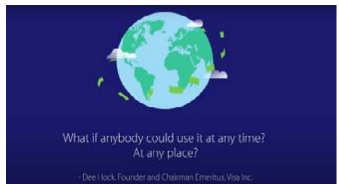
Visa's incredible first 60 years