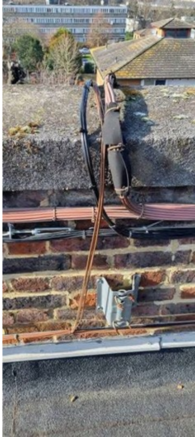
Existing parapet wall