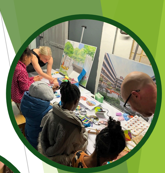
Futures Fair Sunday 24 November 2024

132 residents attended our first Futures Fair, 83 from RBKC, hosting 25 partners from STEAM industries and creatively engaging residents of all ages in pathways to future opportunities and employment